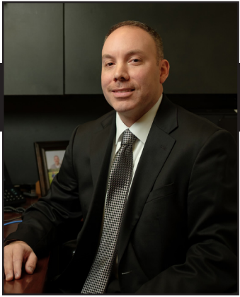
Relationship Manager / AVP